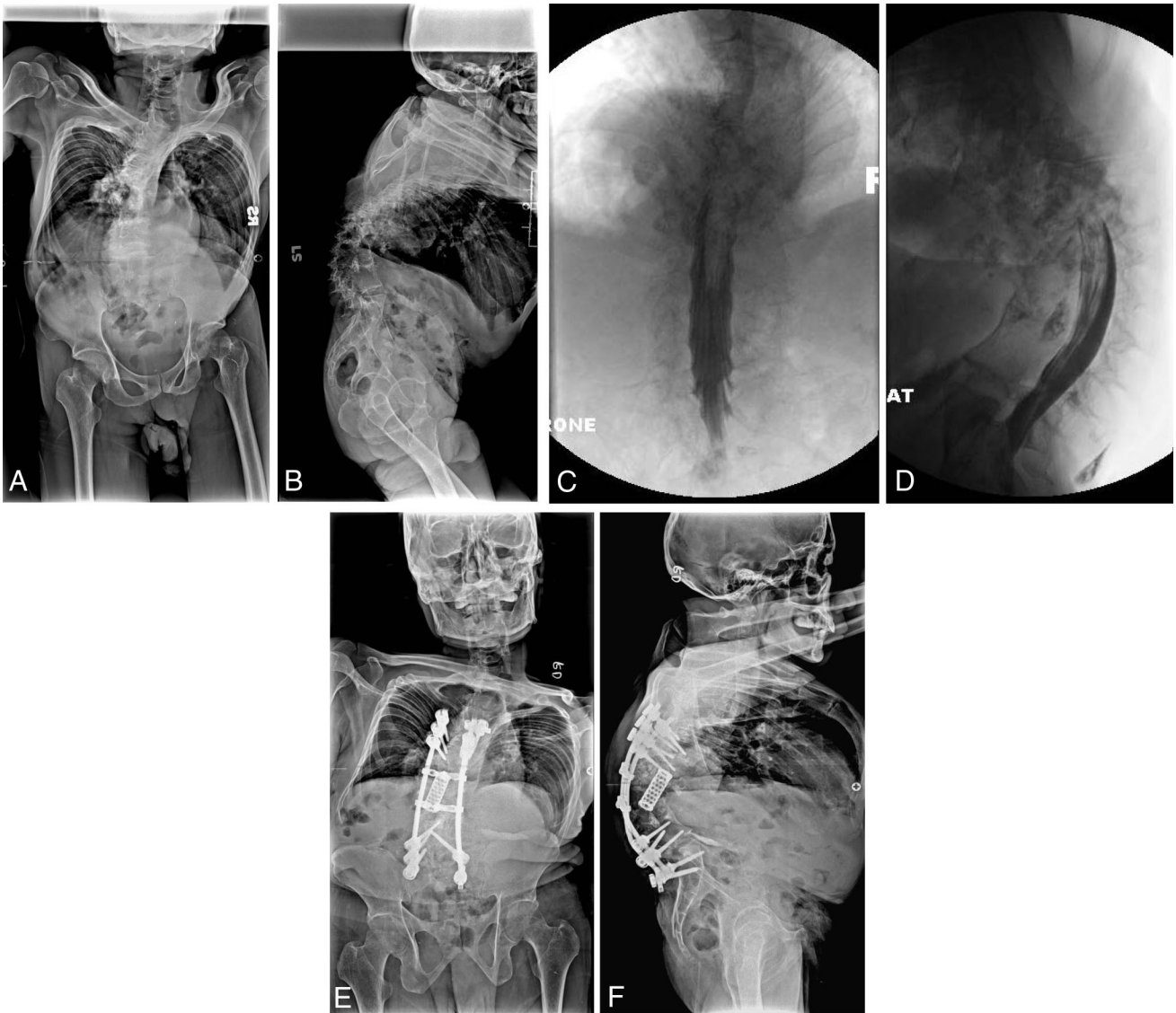
Figure 2. A 52-year-old man with Frankel B neurologic deficits due to postinfectious angular kyphosis. A, B , Preoperative lateral radiograph showed 107° angular kyphosis. C, D , Preoperative myelography revealed cord compromised at the apex. E, F , Postoperative radiographs taken 3.1 year after surgery revealed deformity correction to 68°. Neurologic deficits improved to Frankel E.

Surgical techniques for the reliable and safe correction of severe and rigid angular kyphosis with neurologic deficits are yet to be established. Leatherman and Dickson 2 described a technique for vertebral body resection using a 2-stage, combination anterior and posterior approach. Although Kawahara et al 3 introduced “closing-opening wedge osteotomy,” Shimode et al 4 described “spinal wedge osteotomy,” and Suk et al 5 described “posterior vertebral column resection.” Further to this, Sar and Eralp 6 described a technique for resection of posterior spinal elements and vertebral body and correction of the deformity using a 3-stage combination anterior and posterior approach. All the aforementioned surgical techniques correct angular kyphosis by exposing the apex circumferentially, using the anterior and posterior approach or the single posterior approach and performance circumferential spinal osteotomy. The corrective procedures involve shortening, distraction, and translation of